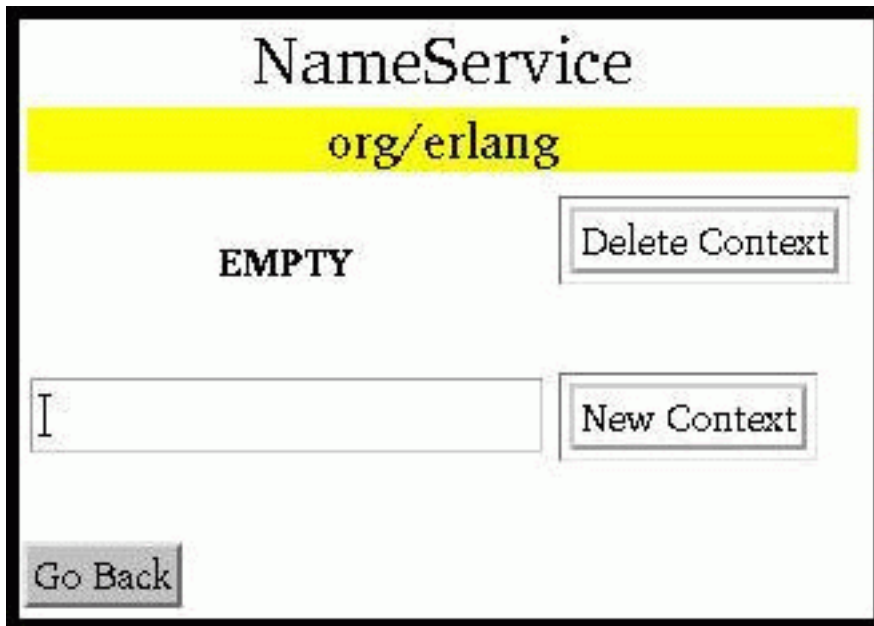
Figure 12.6: Delete Context.

If a context does not contain any sub-contexts or object bindings, it is possible to delete the context. If these requirements are met, a Delete Context button will appear. A completion status message will be displayed after deleting the context.