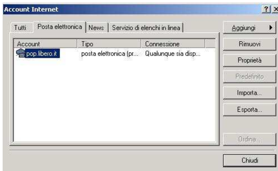
Figure 2: settings