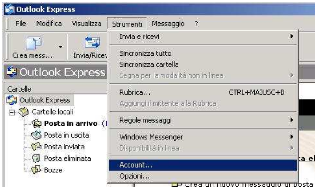
Figure 1: main