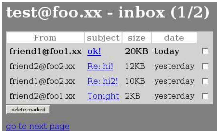
Figure 7: inbox

Now we have to implement the stat() function. The stat is probably the most important function. It must retrieve the list of messages in the webmail and their UIDL and size. In our example we will use the mlex module to grab the important info from the page, but you can use the string LUA module to do the same with captures. This is our inbox page (see figure 7)