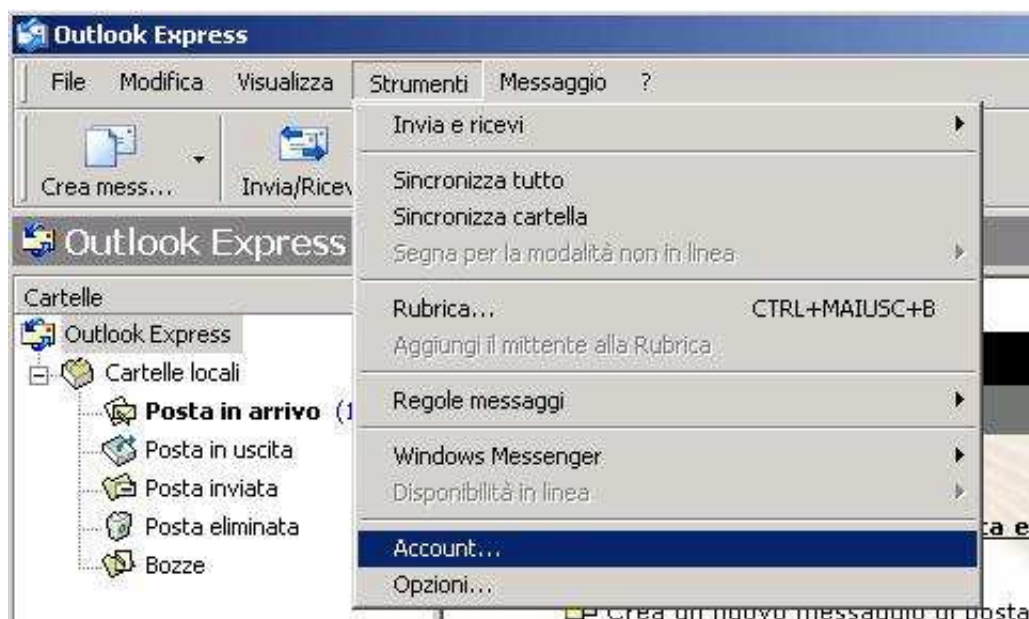
Figure 1: main